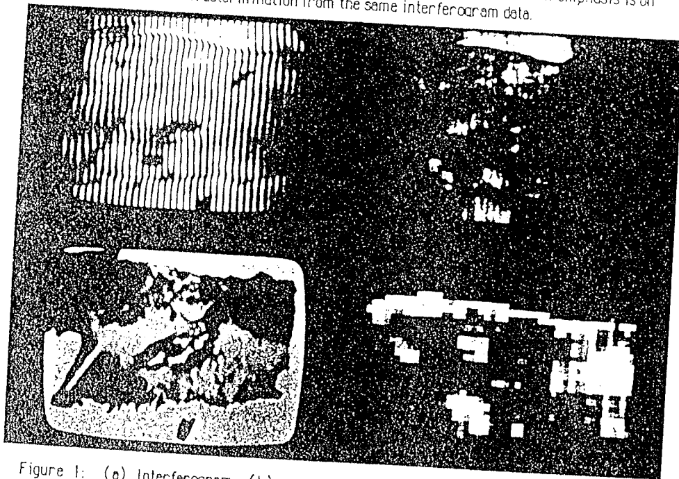
Figure 1: (a) Interferogram, (b), acoustic image, (c) optical image and (d) two dimensional velocity distribution image of 75 \mu\text{m} section of dog skin which contains a 12 day old incisional wound. The pixel size is 64 \mu\text{m} x 64 \mu\text{m} and the light and dark areas correspond to high and low velocity values, respectively, [8].

Figure 1(a) is a photograph of an interferogram shown on the monitor of the SLAM. Two different kinds of information are included in the interferogram i.e. the bending of the equal phase wavefronts carries the information for the determination of the velocity properties and the variation in the amplitude of the equal wavelength sinusoids is due to different attenuation properties in the imaging area. In the next paragraphs the velocity measurement technique is explained briefly because it has already been reported in detail [8]. The main emphasis is on the attenuation coefficient determination from the same interferogram data.